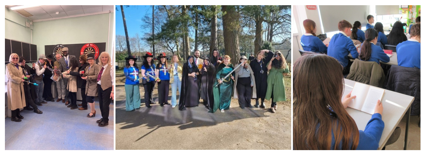
Maths - Mystery

English and Languages - Literature Greats