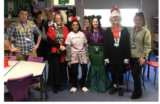
SEN - Disney

running until the end of March, there is still plenty of time for students to get involved. Keep those guesses coming and see if your son/daughter's tutor group can claim the top spot!